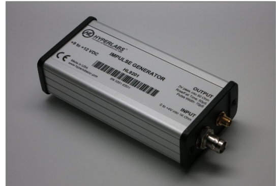
Figure 1: HL9201 Triggerable Impulse Generator (50 ps)