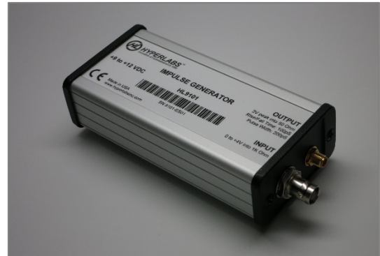
Figure 1: HL9101 Triggerable Impulse Generator (100 ps)