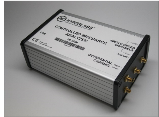
Figure 1: HL3204 Controlled Impedance Analyzer